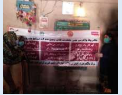
IEC material on COVID_19 displayed at prominent places at District Shikarpur under HelpAge Project