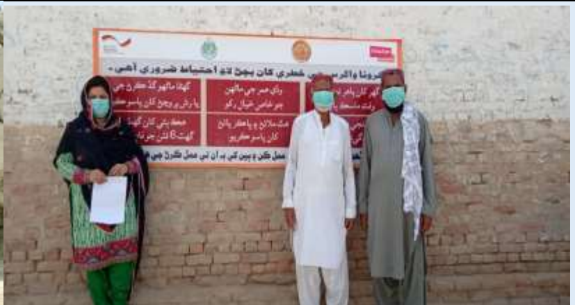
IEC Material displayed at different prominent places of district Jacobabad under HelpAge Project