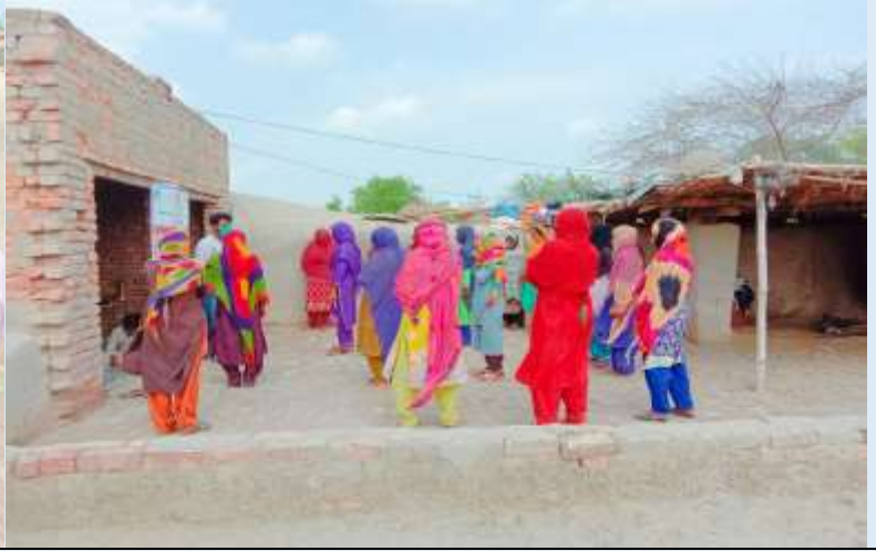
COVID-19 awareness social distancing and hand washing activities at District Badin