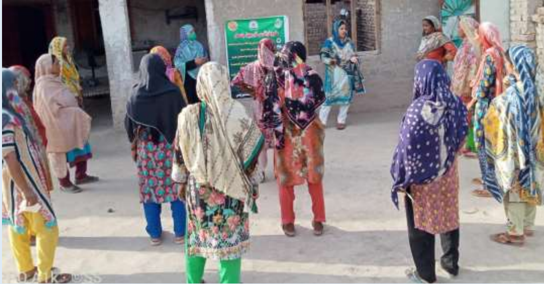
COVID-19 Awareness session at Khairpur