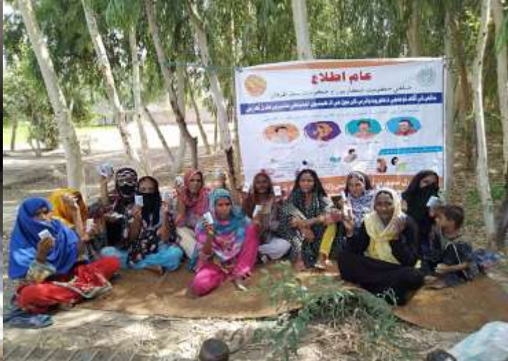
COVID_19 awareness session and distribution at district Shikarpur